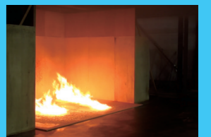
Suppression of a fire