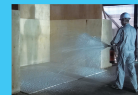
Discharge Quick splasher