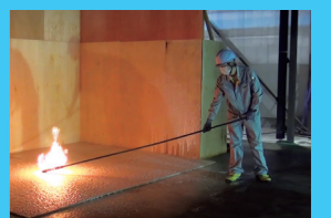
Has good suppression effect.