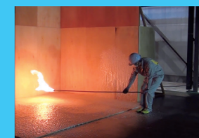
It will not ignite even if there is a fire.