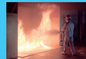
Discharge Quick splasher